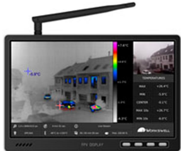
Workswell WIRIS can be fully controlled by a traditional RC controller from which all system functions can be accessed. In addition to all functions, the monitor displays images from the thermal camera as well as colour camera. Information is available about the measured temperature (min/max and central spot) during the flight.

However, Workswell WIRIS also has additional functions suitable for this application: for example, continuous ZOOM (up to 14x for thermal camera and 16x for colour camera) for exact localization of the problem or to control NUC calibration so it is done at the correct moment.