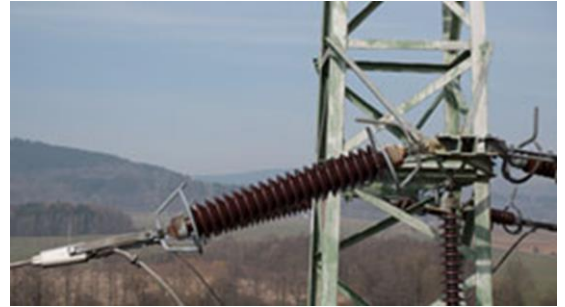
Photographic image from an aviation inspection of high-voltage distribution lines. Although there is nothing to be seen on the photo, there is a defect on the joint in the form of high transient resistance. The electric joint has become overheated and according to the recommendation in ISO 18434-1 should be repaired as soon as possible.

The thermal imaging system for Workswell WIRIS drones from Workswell are designed for assembly on the drone (UAV). The set is light, mobile and fully controlled using a standard RC controller. The system combines two camera systems - a camera for visible spectrum (for inspection of visible defects to piping) and a thermal camera (for detection of hidden defects). The servicing software enables to remotely switch camera regimes, record radiometric videos and to produce static images in the visible and infra-red spectrum. The operator sees any objects under the drone in real time and can analyse the records in order to identify damaged areas.