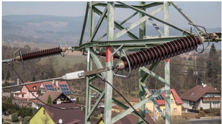
Joint on the high voltage distribution line. The place where a problem may occur, i.e. origination of transient resistance with consequent overheating.

Each element of the distribution network is at risk of a series of defects that can result in energy losses and/or a major security risk. Unfortunately, the breakdown of the electricity supply from a failure in the distribution network does not only affect the electricity supplier financially, but also a very high number of inhabitants, as well as companies and health facilities. Failures mean that direct threats to lives can occur. Therefore, all elements of the distribution network must be checked to prevent any of the mentioned problems.