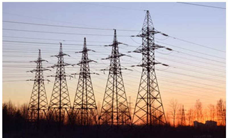
Columns and distribution lines for high voltage networks.

Electrical power stations produce AC currents with voltages of several thousand volts. When transmitting over long distances, the voltage is transformed by electrical power stations to very high voltages of 110 kV, 220 kV or 400 kV. Individual electrical power stations are connected to the distribution network by overhead lines. The element that connects the transmission and the distribution part of the distribution network are the transformer stations.